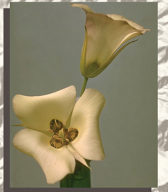
Catalina Mariposa Lily ( Calochortus catalinae )