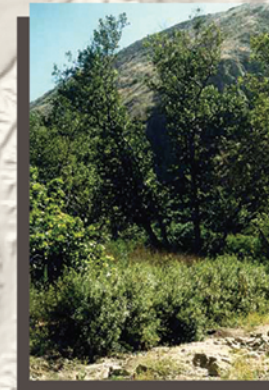
Riparian Woodland Habitat Community