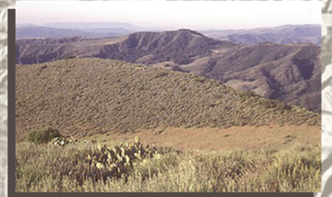
Coastal Sage Scrub Habitat Community