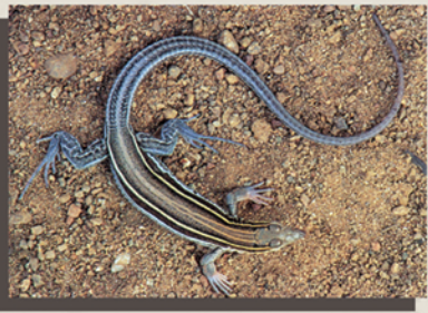
Orange-throated Whiptail Lizard ( Cnemidophorus hyperythrus beldingi )