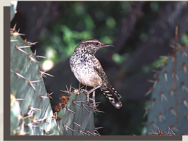
Coastal Cactus Wren ( Campylorhynchus brunneicapillus )