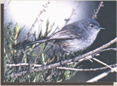
California Gnatcatcher ( Polioptila californica )