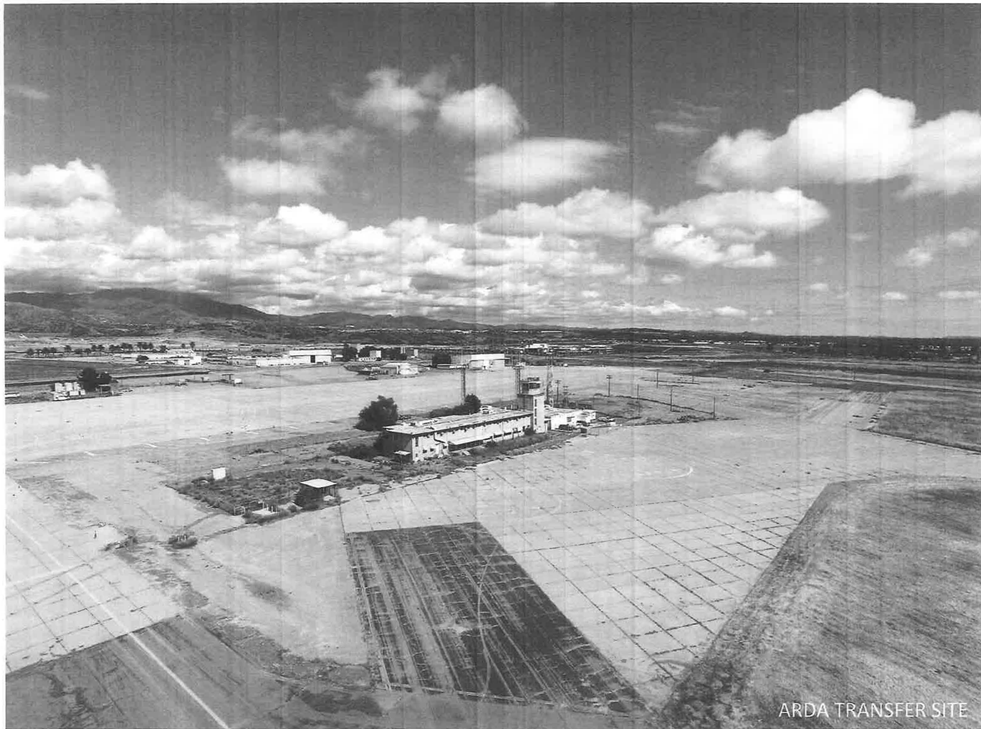
ARDA TRANSFER SITE