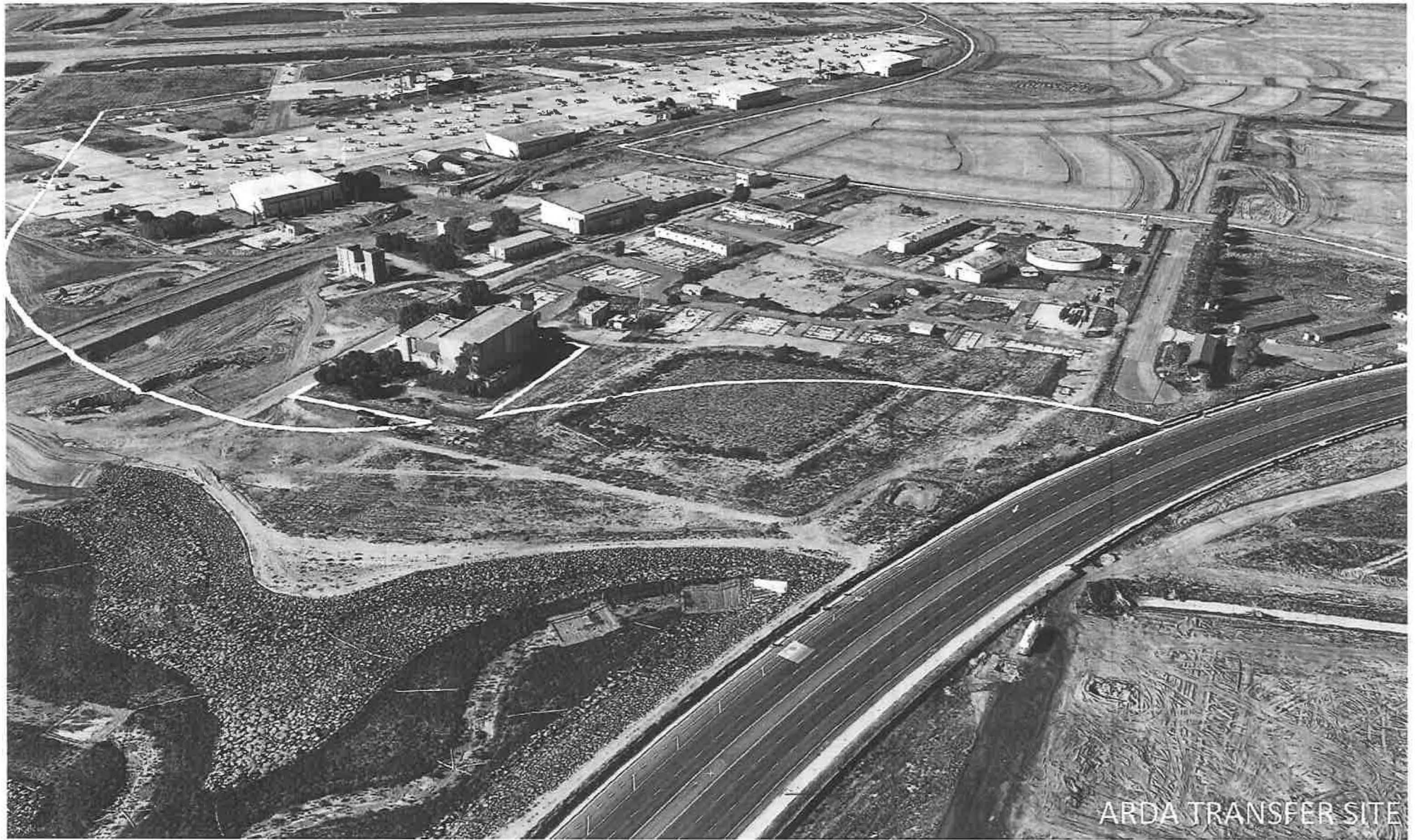
ARDA TRANSFER SITE