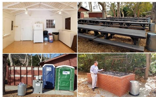
AMENITIES AND EQUIPMENT