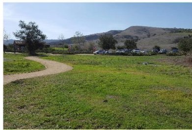
NATURALIZED MEADOW GRASS