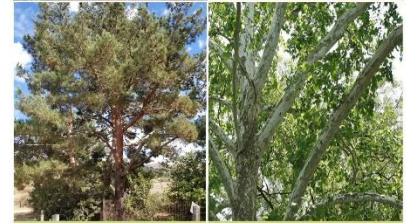
SHADED TREE CANOPY