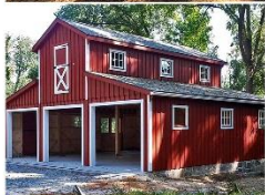
AGRICULTURE / FARM