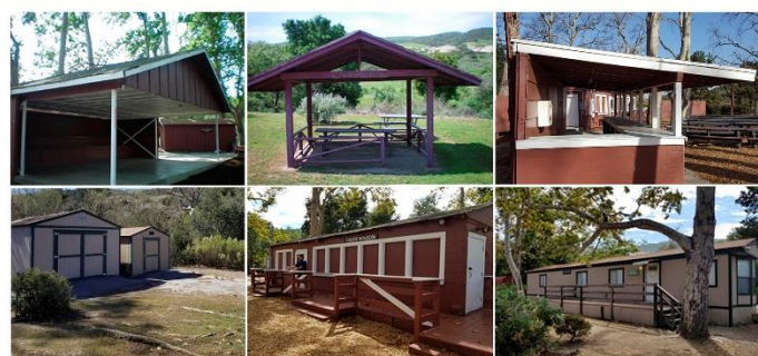
REPLACE AGING STRUCTURES