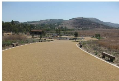
EPOXY STONE SURFACE