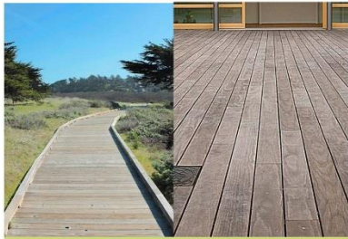
BOARDWALK / WOOD DECK