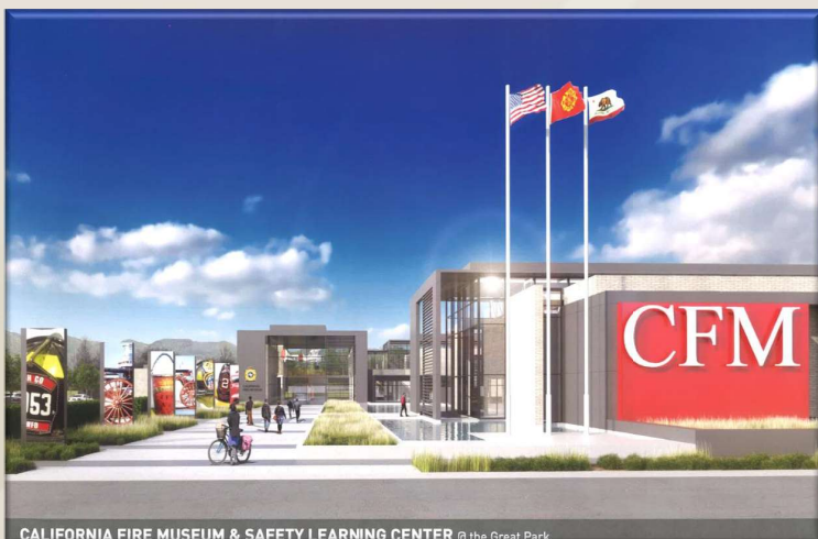
CALIFORNIA FIRE MUSEUM & SAFETY LEARNING CENTER @ the Great Park Conceptual rendering courtesy of TVA Architects