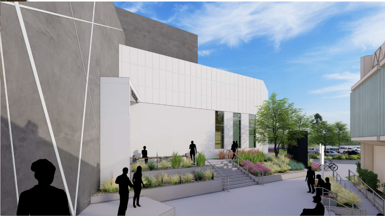
New Performing Arts Complex (courtyard)