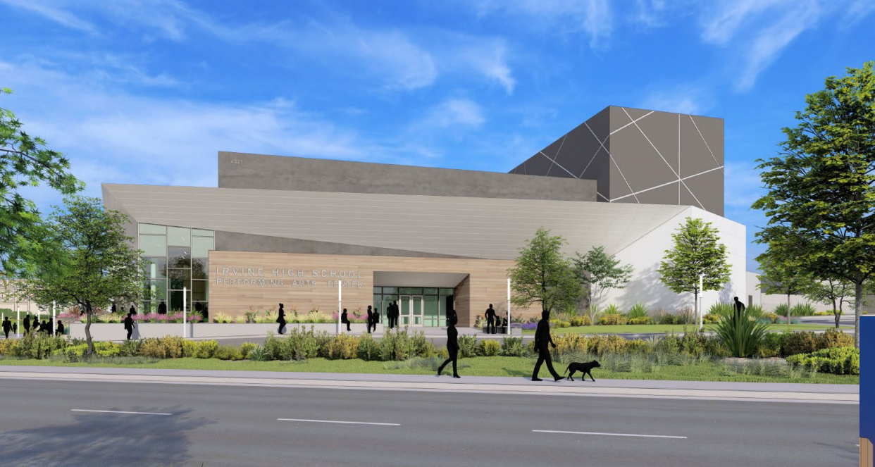
New Performing Arts Complex (street view)