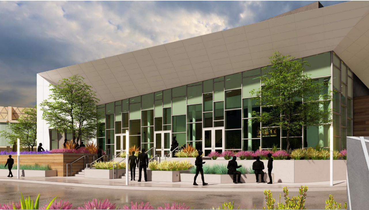
New Performing Arts Complex (main entrance)