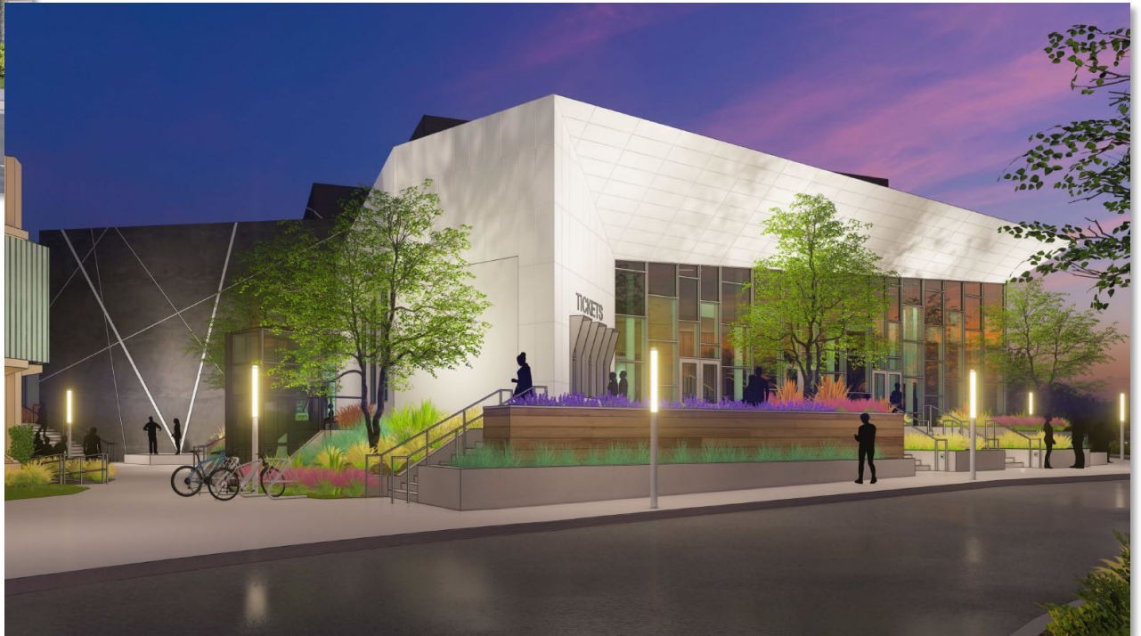
New Performing Arts Complex (drop off view)