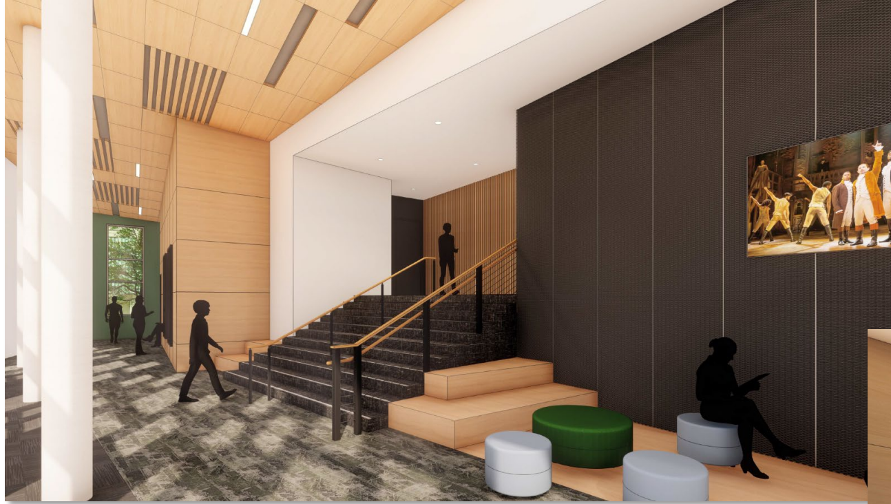
New Performing Arts Complex (lobby)