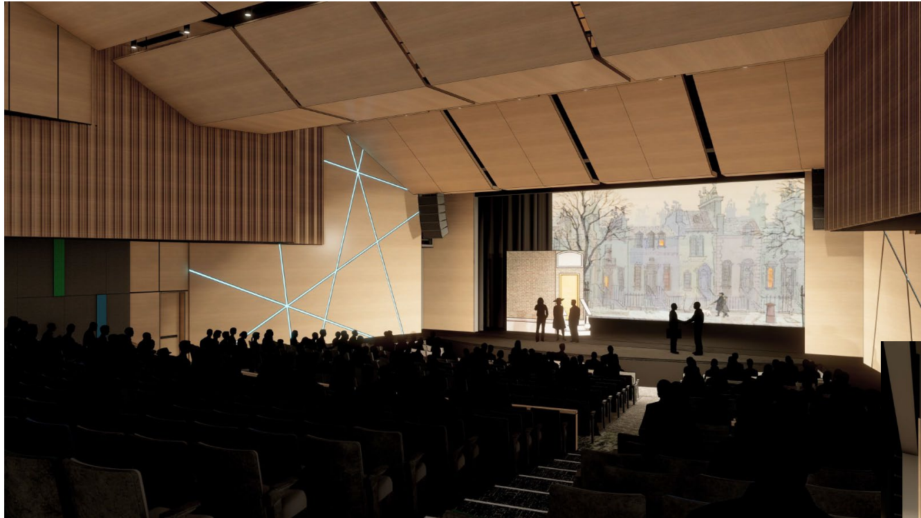
New Performing Arts Complex (audience view)