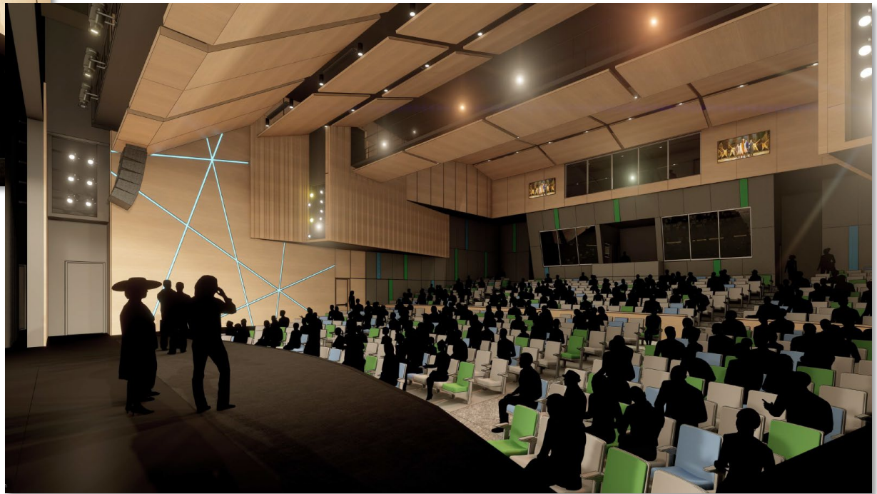
New Performing Arts Complex (stage view)