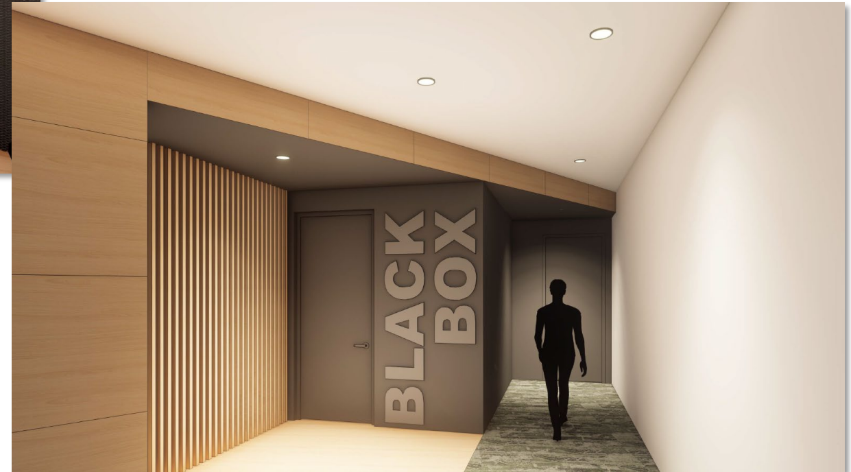
New Performing Arts Complex (black box entrance)