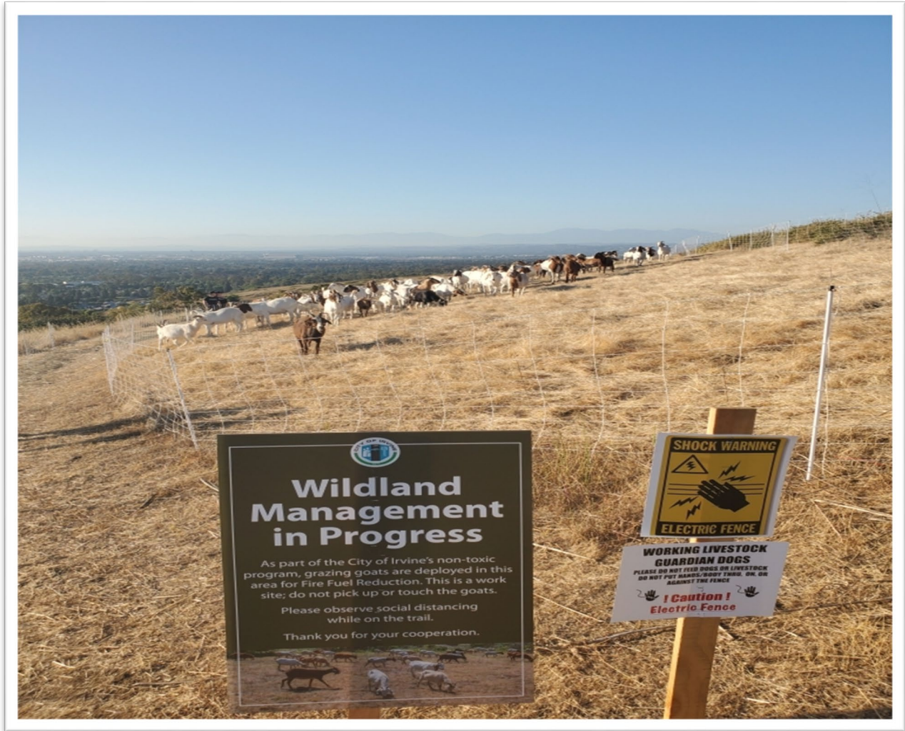
Example of goats performing weed abatement in the City's open space.

The Landscape Division also used biological control to reduce pest populations. Biological control uses organisms often referred to as beneficials, natural enemies, or biocontrols. The biological controls act to keep pest populations low enough to prevent significant economic damage. The most common organism types used for biological control in landscapes to combat pest populations are predators and parasites. In 2021, nearly 700,000 beneficial insects were released in the parks and streetscapes to combat destructive pests, instead of relying on pesticides.