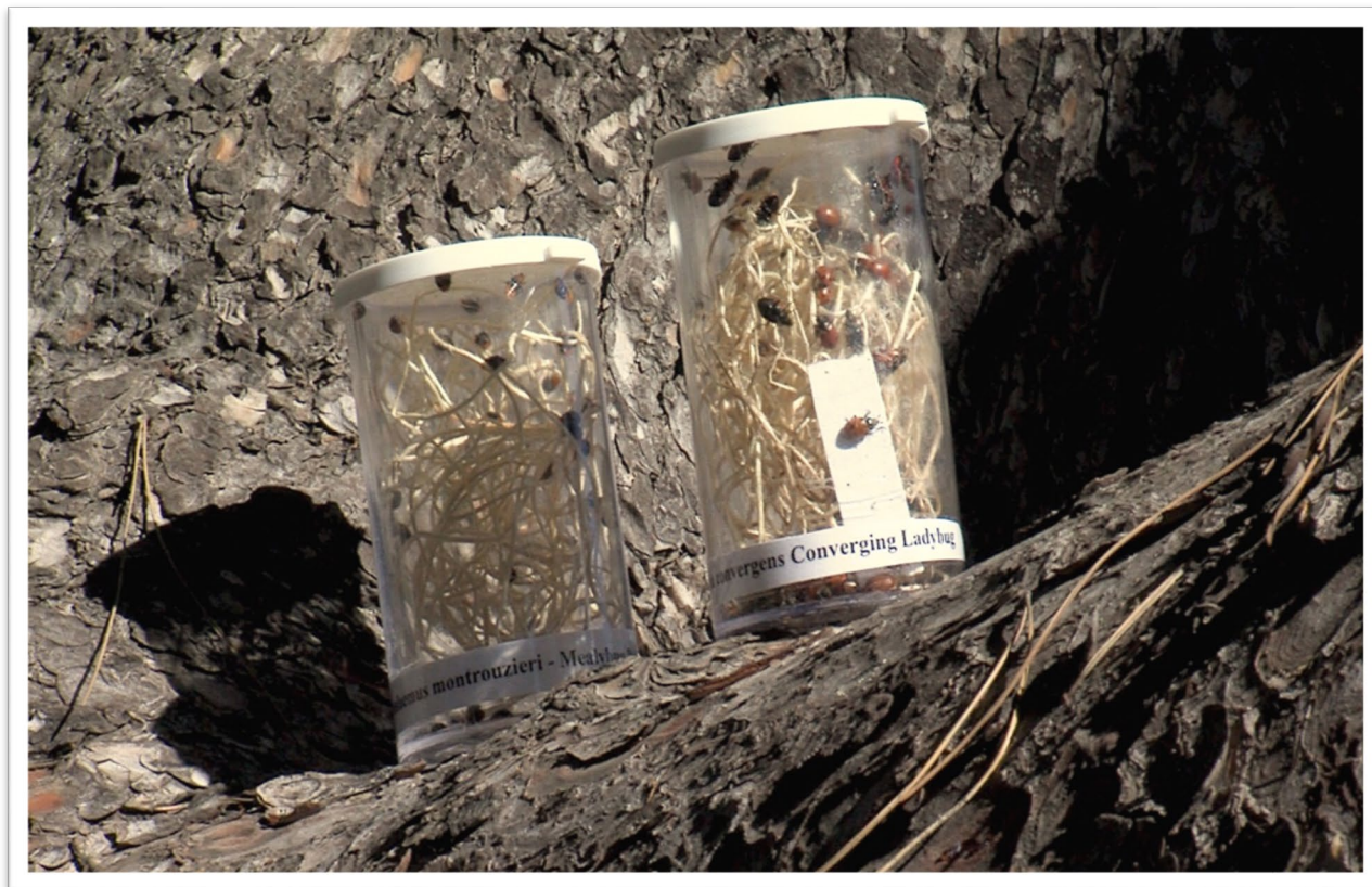
Example of beneficial insects about to be released in a City park.

Lastly, Landscape modification and proper sanitation continues to be an effective non-chemical approach to rodent management. By removing plants away from buildings, removing understory vegetation and using closed trashcan receptacles, rodent populations are manageable.