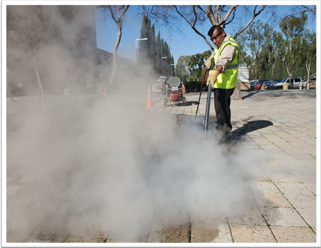
Example of a landscape contractor using steam to eradicate weeds in hardscapes.

The City is responsible for maintenance of 100 acres of fuel modification zones in the Village of Turtle Rock where goats were used for vegetation management. The use of goats demonstrates an alternate method to manage property without pesticides or contract labor. In 2021 during the pandemic, it was difficult to manage the goat's grazing in a safe manner due to the daily, heavily visited open space by the public. The goats became an attraction that led to many complaint calls from nearby residents due to the excessive traffic in their neighborhoods. In addition, a lack of normal rainfall led to reduced favorable vegetation for the goats to feed on. Therefore, staff had to employ flail mowing to properly finish the job for Orange County Fire Authority approval.