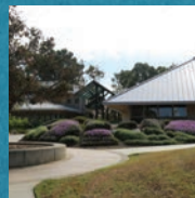
University Community Center & Park 1 Beech Tree Ln. 949-724-6815