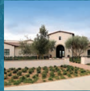
Portola Springs Community Center & Park 900 Tomato Springs 949-724-6192