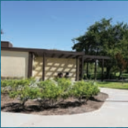
Deerfield Community Center & Park 55 Deerwood West 949-724-6725