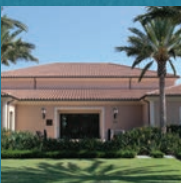
Los Olivos Community Center & Park 101 Alfonso 949-724-6292