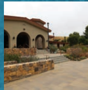
Quail Hill Community Center & Park 39 Shady Canyon Dr. 949-724-6814