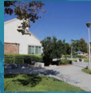
Northwood Community Center & Park 4531 Bryan Ave. 949-724-6728