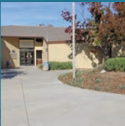
Irvine Fine Arts Center 14321 Yale Ave. 949-724-6880