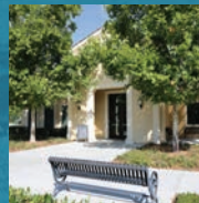
Turtle Rock Community Center & Park 1 Sunnyhill Dr. 949-724-6734