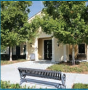
Cypress Community Center & Park 255 Visions 949-724-6190