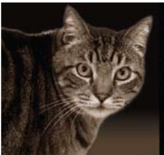
BUDDY CAT A052385 OWNER DIED

Please visit our Web site for a list of items needed in our animal clinic to help our Shelter pets... www.irvineshelter.org