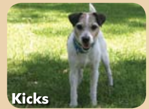
Kicks Jack Russell Terrier • 9 years old

Lucy is a great girl that walks well on leash and is super-sweet and loving. She warms up quickly to people and would love a home with you!