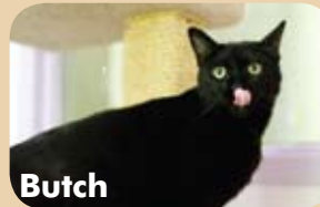
Butch Domestic Shorthair • 10 years old

Butch is a super-friendly senior cat that is laid back and easy to handle. He likes to play when he is comfortable with the environment and is very attached to his brother, Cassidy. Adopt them both for just one adoption fee!