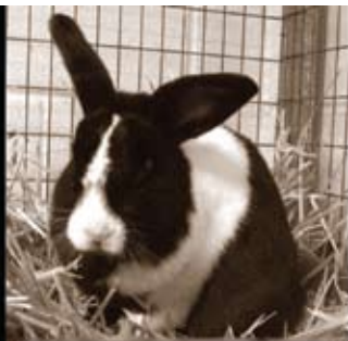
OREO COOKIE A054230 HOME FORECLOSURE