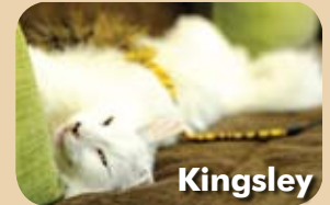
Kingsley Domestic Longhair • 13 years old

Butch is a super-friendly senior cat that is laid back and easy to handle. He likes to play when he is comfortable with the environment and is very attached to his brother, Cassidy. Adopt them both for just one adoption fee!