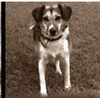
CASSIDY 2 A054295 OWNER MOVED

SHELTERED ANIMALS DIDN'T DO ANYTHING WRONG