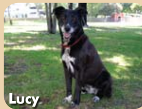
Lucy Labrador Retriever mix • 13 years old

Kingsley likes other cats, is hand-some, super friendly but can also be moody like a cat at times. Kingsley's front feet are declawed.